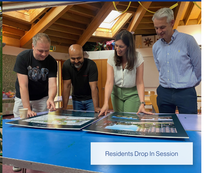
Residents Drop In Session