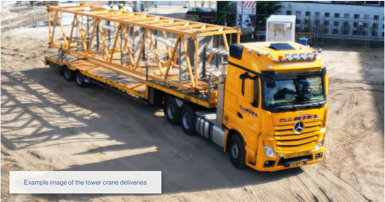
Example image of the tower crane deliveries

number of large-scale deliveries with equipment being delivered on a large 40 foot lorries. Each of these large plant deliveries will be conducted in line with Transport For London's requirements and the appropriate permissions in place.