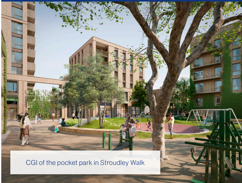
CGI of the pocket park in Stroudley Walk