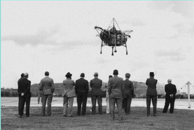
FLYING BEDSTEAD 1953